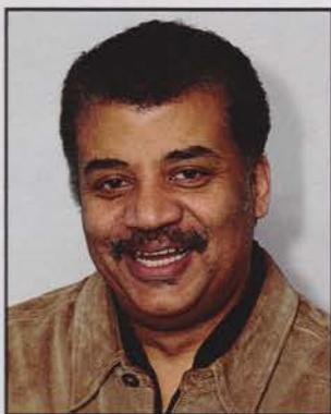
Neil deGrasse Tyson

Stellar astrophysicist, director of the Hayden Planetarium in New York City and baritone host of "StarTalk." The second season of the late-night cosmos-themed show premieres this month on National Geographic Channel.